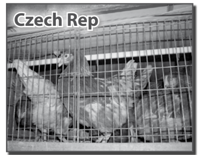
20 more chickens liberated from battery cages.