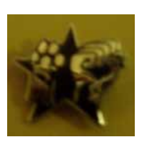
Fist and paw badge - black/chrome

The three pictures on the left give you a rough idea of the three designs of badges we have available.