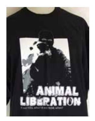
T-shirt - £10 inc postage (sizes S, M, L & XL)