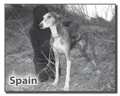
Greyhound rescue dedicated to Jake Conroy, one of the US SHAC7.