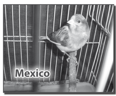
Canary rescued from tiny cage, this is just one of many actions in Mexico.

Liberations in the past four months in Mexico, Spain, Italy, Netherlands, UK, USA, Czech Republic and France