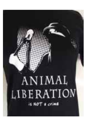
T-shirt - £10 inc postage (sizes S, M, L & XL)