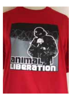
T-shirt - £10 inc postage (sizes S, M, L & XL)