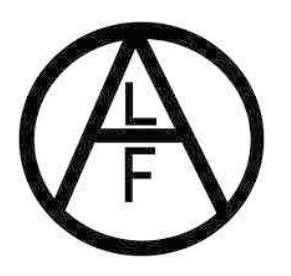
Circle badge - availiable in black/white, black/ chrome, black/red, black/ purple and black/green