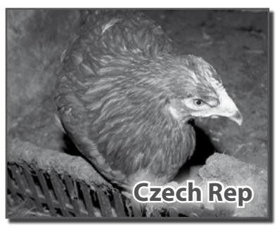
8 chickens 'rehomed' by Czech activist from battery unit.