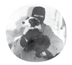
Activist and liberated dog badge - gilt/black/ white