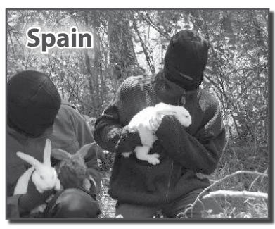
10 rabbits taken to safe, loving homes, courtesy of brave saviours.