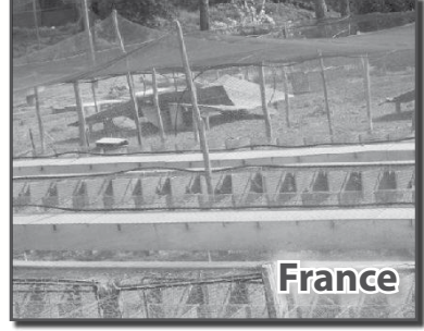
Ducks and other birds about to enjoy the experience of life without netting.