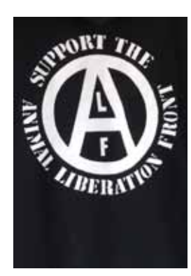
T-shirt - £10 inc postage Hoody - £20 inc postage (sizes S, M, L & XL)