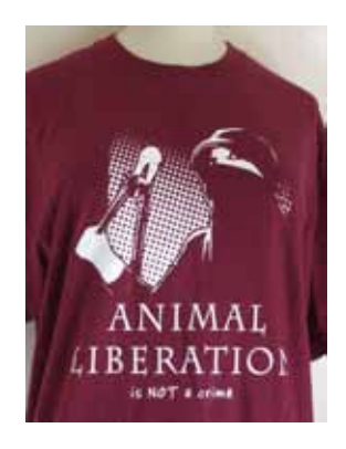
T-shirt - £10 inc postage (sizes S, M, L & XL)