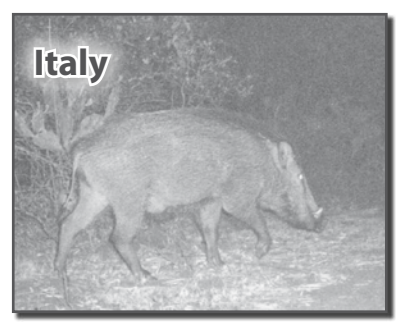
An imprisoned boar was liberated, he rejoined his friends & went off into the night