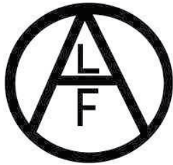
Circle badge - available in black/white, black/chrome, black/red, black/purple and black/green