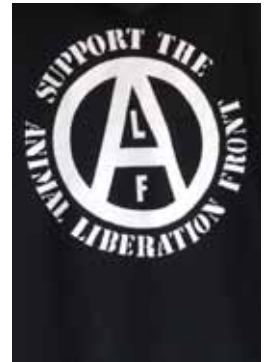
T-shirt - £10 inc postage Hoody - £20 inc postage (sizes S, M, L & XL)