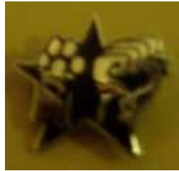
Fist and paw badge - black/chrome

The three pictures on the left give you a rough idea of the three designs of badges we have available.