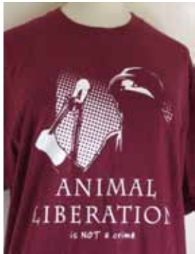
T-shirt - £10 inc postage (sizes S, M, L & XL)