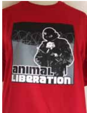
T-shirt - £10 inc postage (sizes S, M, L & XL)