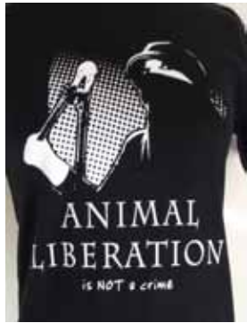
T-shirt - £10 inc postage (sizes S, M, L & XL)