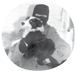
Activist and liberated dog badge - gilt/black/white