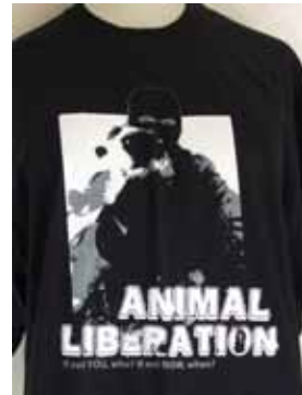
T-shirt - £10 inc postage (sizes S, M, L & XL)